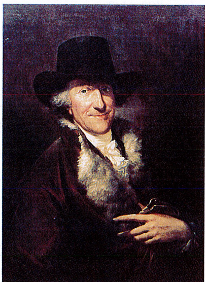
ABOVE: Bach's eldest son, Wilhelm Friedemann (1710–84), painted around 1760. Like his father, he was a composer.

In May 1720, while Bach was away at a spa with his employer, Maria Barbara died suddenly. Bach remarried the next year: his bride, Anna Magdalena Wilcken (1701–60), proved a great asset to her husband, both domestically and professionally (the daughter of a musician, she was a singer, harpsichordist and music copyist). She inherited Bach's four surviving